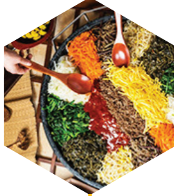
Traditional Bibimbap Experience