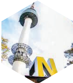
Seoul N Tower